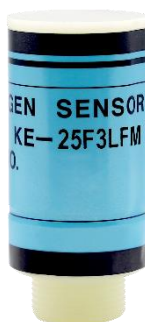
Lead-free galvanic cell-type oxygen sensor KE-25F3LFM

Compliant with RoHS directive *1 while achieving 20% longer *2 life