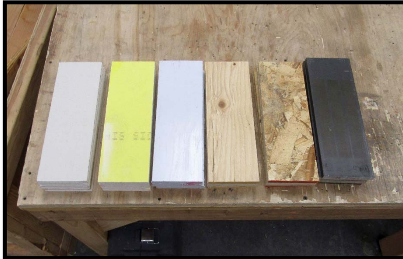
Peel adhesion test substrates