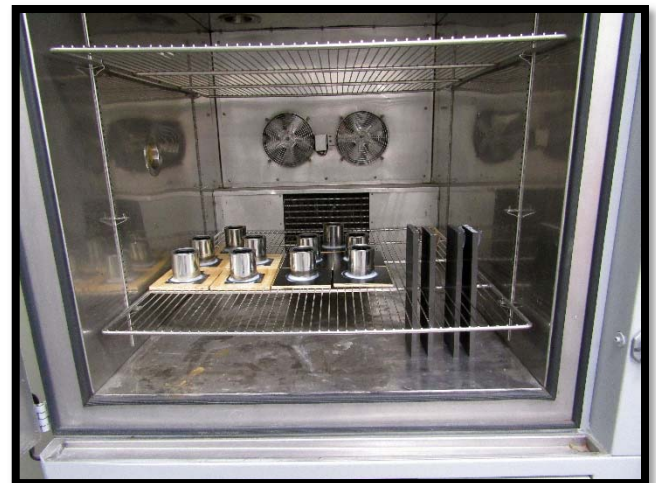
Test samples inside test chamber