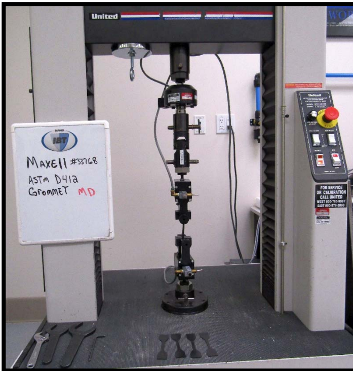
Tensile Strength Test