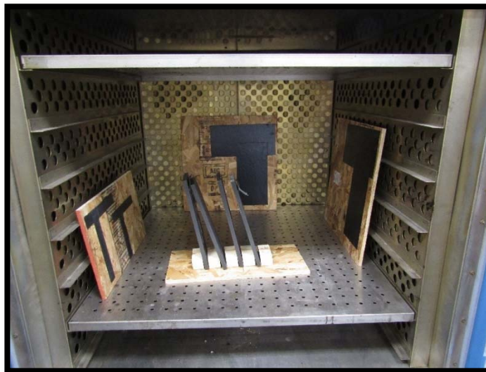
Samples in oven