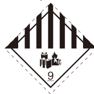
Lithium battery hazardous label