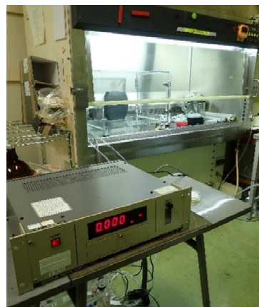
Scene of an experiment during the study